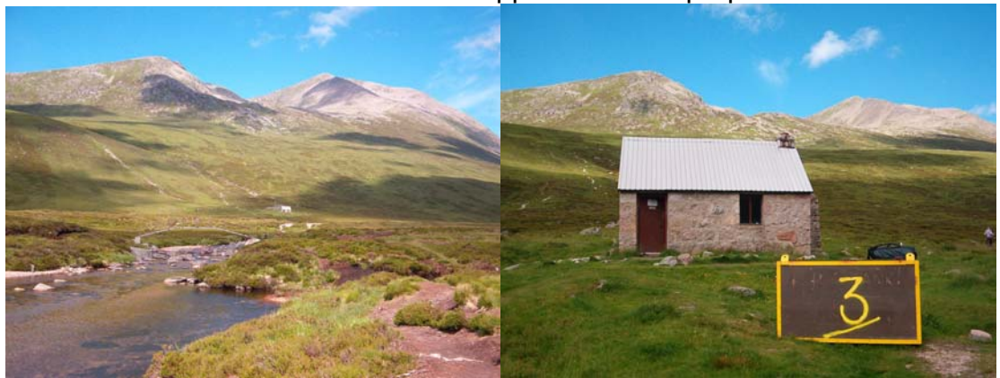
Figs 1 & 2 Distant and close up view of Corrour Bothy with Cairn Toul in background

2. The bothy lies on land contained within the National Trust's Mar Lodge Estate which is aware of and supportive of the proposal.